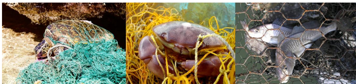
Figure 3. Trash Entanglement (NOAA Marine Debris Program 2013).

In addition to ingestion, entanglement can result when an animal becomes encircled or ensnared by trash. Entanglement can cause wounds and associated infections, strangulation or suffocation, and impair the ability of an animal to swim, fly, find food, and escape predators (Figure 3; U.S. EPA 1992). Once entangled, animals have trouble eating, breathing or moving, all of which can be fatal. Similar to the discussion on trash ingestion, the studies describing effects of trash entanglement in marine environments also apply to freshwater and estuarine environments since the impacts are the same, regardless of the aquatic habitat.