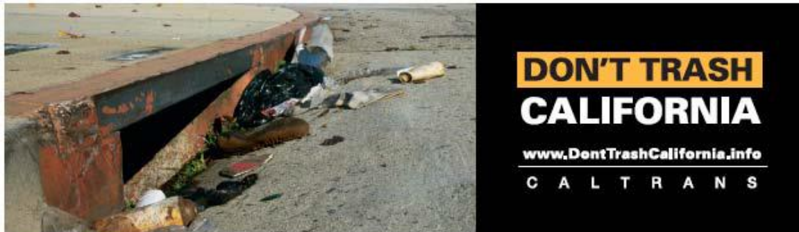
Figure 5. Don't Trash California (Caltrans).

studies have documented the presence of trash in state waters and the accumulation of land-based trash in the ocean. Street and storm drain trash studies conducted in regions across California have provided insight into the composition and quantity of trash that flows from urban streets into the storm drain system and out to adjacent waters (Figure 5).