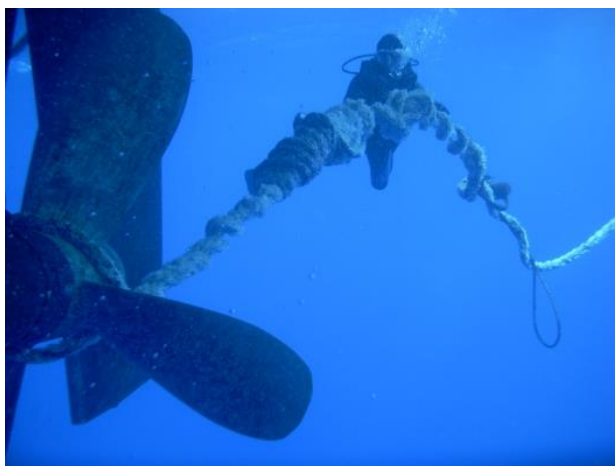
Figure 4. Entangled Propeller (NOAA Marine Debris Program).

Beyond the immediate health and safety hazards caused by trash, the presence of trash in state waters can also affect beneficial uses of waters where there is less bodily contact with water. Damage to boats, rafts, and other recreational vessels through entanglement of equipment and propellers can lead to potentially hazardous and perhaps fatal situations for boaters (Figure 4). For these circumstances, trash present in waters designated for recreational activities and for transportation can impact the beneficial uses of non-contact water recreation and navigation, respectively.