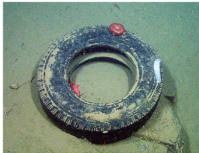
Figure 2. A Discarded Tire in Monterey Canyon (Monterey Bay Aquarium Research Institute).

Trash is found settling in the deep-sea to depths of 13,028 feet. Specifically in the Monterey Canyon, trash is most abundant where aggregation and downslope transport of trash from the continental shelf are enhanced by canyon dynamics (Figure 2). Based on 1,149 video records over a 22-year time period, the majority of trash was plastic (33%) and metal (23%) with relatively high number of observations of trash in the deep-sea environment (Schlining et al. 2013). Thus, submarine canyons can function to transport trash from coastal to deep-sea habitats.