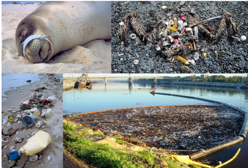
Figure 1. Trash Impacting Beneficial Uses (NOAA Marine Debris Program, Algalita Marine Research Institute, California Coastal Commission, and LA County Flood Control District).

Trash is a threat to aquatic habitat and life as soon as it enters state waters. Mammals, turtles, birds, fish, and crustaceans are threatened following the ingestion or entanglement of trash (Moore et al. 2001, U.S. EPA 2002). Ingestion and entanglement can be fatal for freshwater, estuarine, and marine life. Similarly, habitat alteration and degradation due to trash can make natural habitats unsuitable for spawning, migration, and preservation of aquatic life. These negative effects of trash to aquatic life can impact twelve beneficial uses. A summary of specific impacts associated with each aquatic life beneficial use are presented in Table 1.