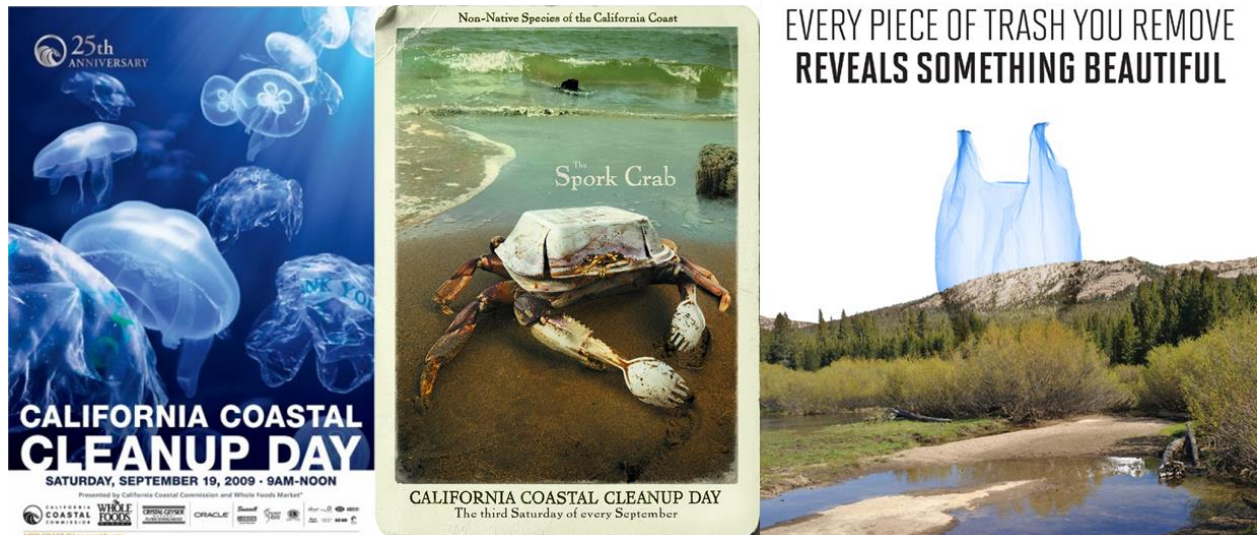
Figure 6. California Coastal Cleanup Day Advertisements (California Coastal Commission).